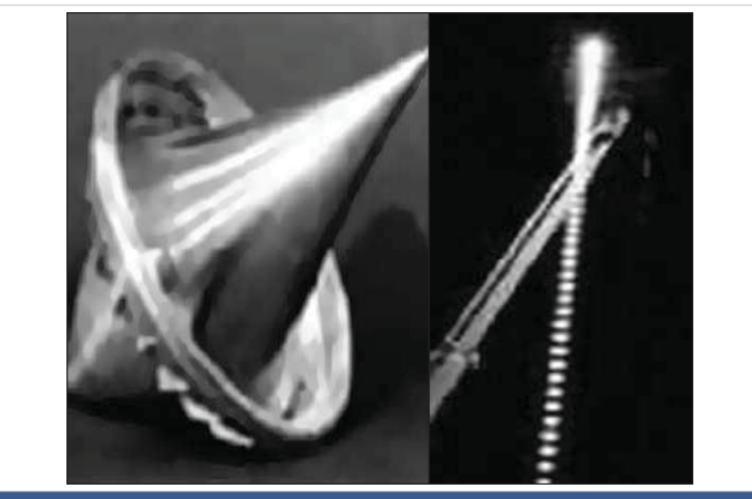
Figure 2: Launch of vehicle (SC) by low rate P-P laser (Rep. rate -20Hz, P=10kW).

As a result of laser radiation concentration in the relatively small volume the breakdown of medium takes place. Air breakdown appears in the region of ionization, which applies to a certain distance following the moving focusing system, and the shock wave, which gives to a moving system additional momentum, leading to its acceleration. Upon the transfer of moving focusing system into rarefied layers of the atmosphere or open space, breakdown and appearing in this case shock wave will be achieved in the easily ionized substance, which the moving system has been supplied in advance. With the